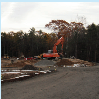
Commercial septic system installation in Brentwood

Please let us know if you would like RCCD to come talk to your local board or planning department about our services.