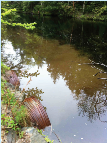
Silt discharging to the Exeter River during a rain event

Please let us know if you would like RCCD to come talk to your local board or planning department about our services.